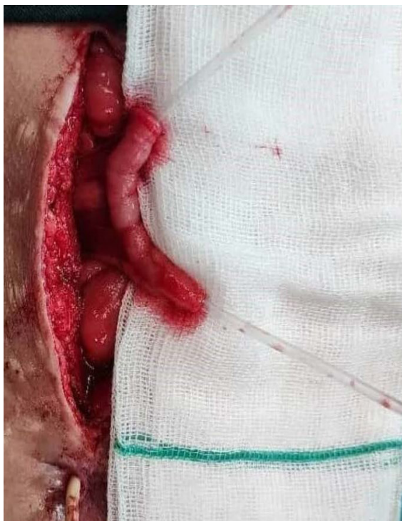
Figure 1. Appendix patency with the 10F catheter.

Additionally, patients were asked about the occurrence of involuntary leakage of urine from the stoma site, and were asked to provide a subjective assessment of the severity of this symptom, measured in terms of the number of pads used per day.