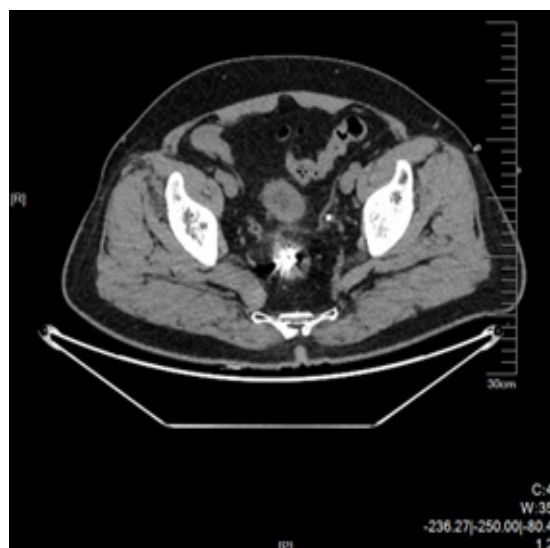
Figure 2. CT scan shows a nodular high-density shadow (titanium clips) in the rectal cavity, without fluid or gas accumulation around the rectum.