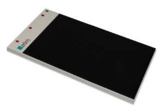
Figure 1. A Zebris Pedobarograph Platform