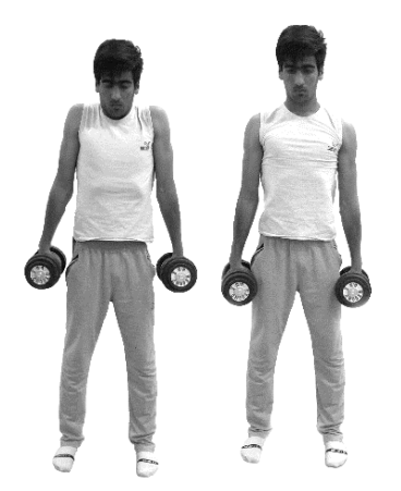
Figure 2. Position of the subjects during fatigue protocol

However, new approaches discuss that the importance of proprioception is not limited to receiving enough ad timely information from mechanoreceptors in contrast, central processing, motor output have more significant importance. Perception cannot be simply defined as receiving information, but it is a process of memory and learning which is totally dependent on the ability of the person to integrate and use the information gathered by proprioception. In accordance with this approach, since athletes are involved in learning more complex skills, they are more engaged in the central processing of proprioception process compared normal individuals who do their routines activities automatically (14). There are few studies