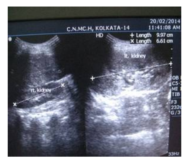
Figure 1. Shrunken Right Kidney in Ultrasound

RI more than 0.8 indicates irreversible microvascular change in the kidneys. Renal angiography showed complete occlusion of the right renal artery and normal flow in all other branches of aorta (Fig 4, 5 & 6).