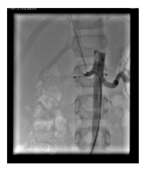
Figure 4. Angiography Showing Complete Occlusion of the Right Renal Artery

angiogram. Initial attempt for stenting was unsuccessful, as guide wire could not be negotiated through the septal occlusion.