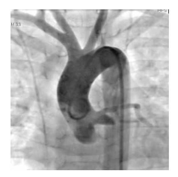
Figure 5. Normal Aorta With its Branches