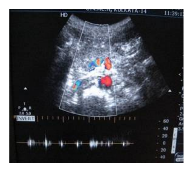
Figure 3. Reduced Flow in the Right Renal Artery With RI 0.9

BP was not controlled with labetalol tablet alone. Nifedipine was added orally. With these two drugs BP was 160/100. Patient was discharged initially with four antihypertensives; oral labetalol 100 mg BD, oral olmesartan 20 mg OD, oral chlorthalidone 6.25 mg OD and oral nicardia retard 10 mg BD. However, BP remained around 160/100. We initially consulted with vascular surgeon regarding reconstructive surgery but the most unique finding in our case was the presence of complete septa totally occluding the lumen of the right renal artery creating total cut-off in the