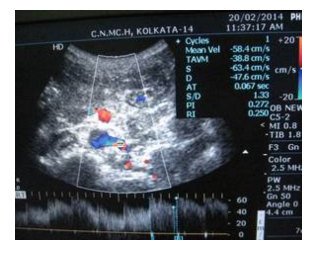
Figure 2. Normal Flow Pattern in the Left Renal Artery With RI 0.25