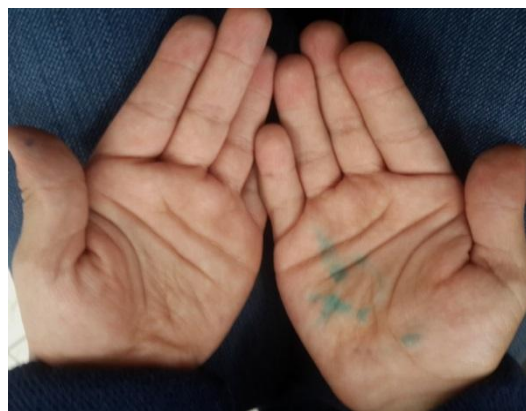
Figure 1. Mild little-finger clinodactyly in William's syndrome

approximately 1 time for nocturnal and no diurnal enuresis).