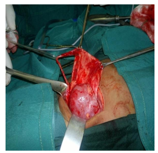
Figure 2 Intraoperative picture of giant hydronephrosis (case 2)