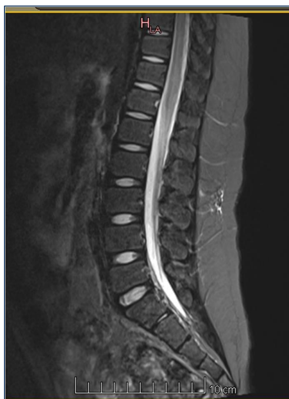
Figure 3. T2W (MRI) image showing normal spine.

The Foley's catheter was removed after completing the course of acyclovir therapy and he was able to void completely. Follow-up ultrasound KUB revealed a PVR of 65mL without any pelvicaliceal dilatation.