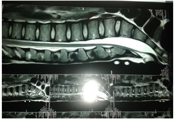
Figure 3. MRI showing tethered cord

MRI of the lumbosacral spine showed spinal cord ending at the level of L3-4 that was thicker than usual, consistent with a diagnosis of tethered spinal cord syndrome (Figure 3).