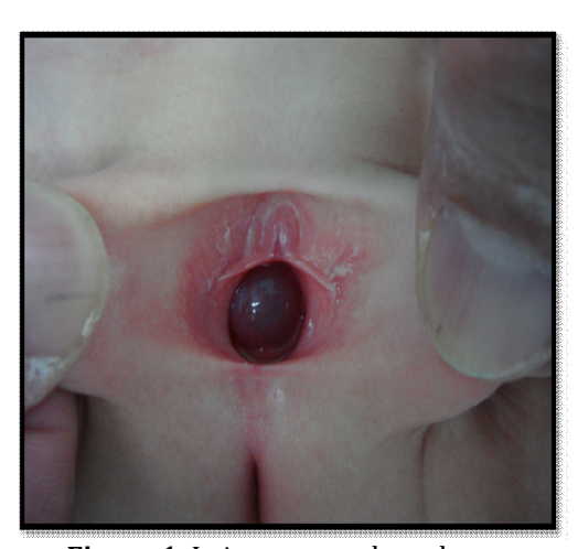
Figure 1. Loin mass at the vulva