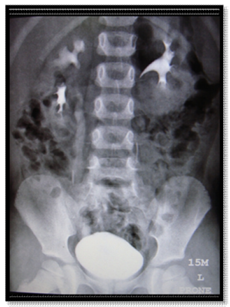
Figure 3. IVP of the patient