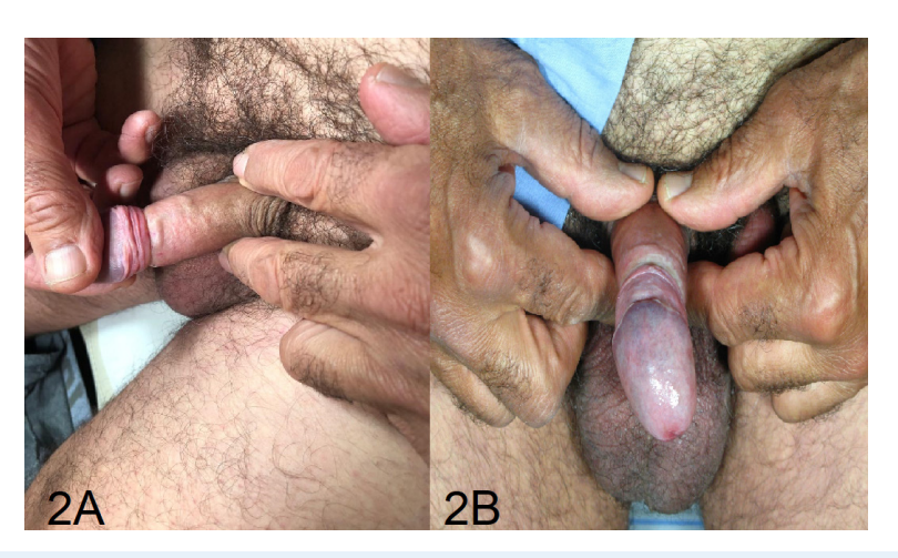
Figure 2. Penile Lichen Sclerosus Before (a) and After (b) Treatment.

patient tolerated the treatment well, and he did not report any side effects.