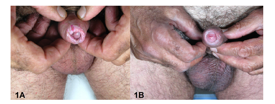
Figure 1. Penile Lichen Sclerosus Before (a) and After (b) Treatment.