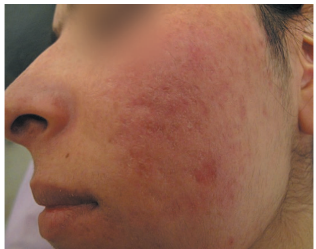
Figure 4. 28-year-old woman with acne scar pre (left) and 6 months after the first session (right).