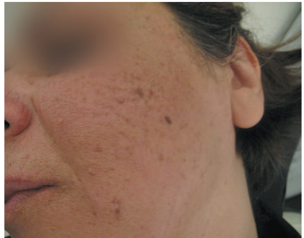
Figure 3. 45-year-old woman with acne scar pre (left) and 6 months after the first session (right).