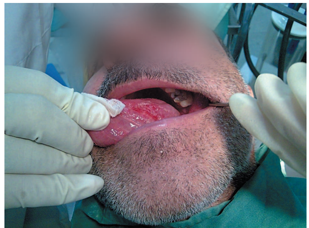
Figure 3. Immediately after procedure