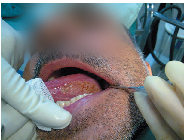
Figure 2. The view of ablating surface