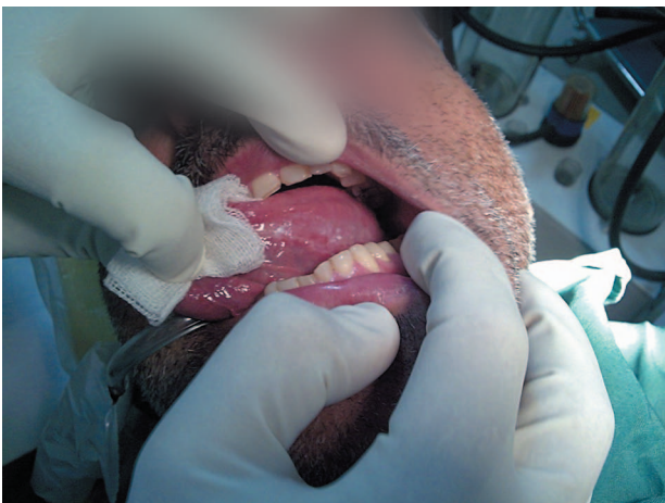
Figure 1. Leukoplakia on the ventral surface of the tongue

Also, the patient did not suffer from any