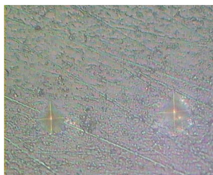
Figure 1. A View of the Effect of the Microhardness Test Indenter on the Enamel.

The means and standard deviations of microhardness of different study groups at various depths are presented in Table 1 and Figure 2 (group 1: control, group 2: saliva, group 3: MI Paste Plus, group 4: Er:YAG laser, group 5: Er:YAG laser plus MI Paste Plus).