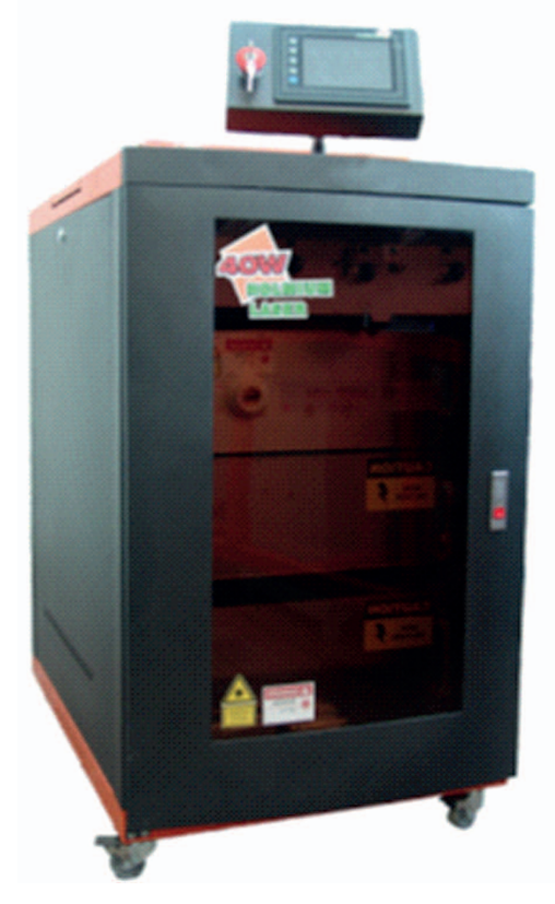
Figure 1. Holmium laser was manufactured by institute of LASER science and technology related to Iran's atomic energy organization.