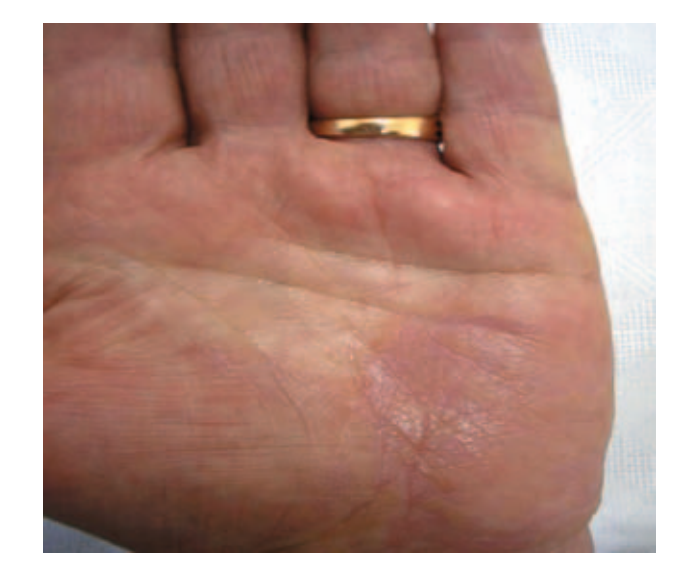
Figure 3,4. Patients in group A (calcipotriol+UVA)