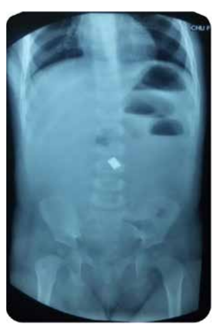
Figure 1: Plain X-ray shows the radio-opaque foreign body with multiple air-fluid levels.

exploratory laparotomy was performed. There were two small bowel perforations, located at 40cm and 130cm distal to duodeno-jejunal junction. Two magnetic pieces were attracting each other through the intestinal wall. Perforations were primarily repaired and magnetic bodies were extracted. The child was discharged after 10 days of hospital stay with a good recovery.