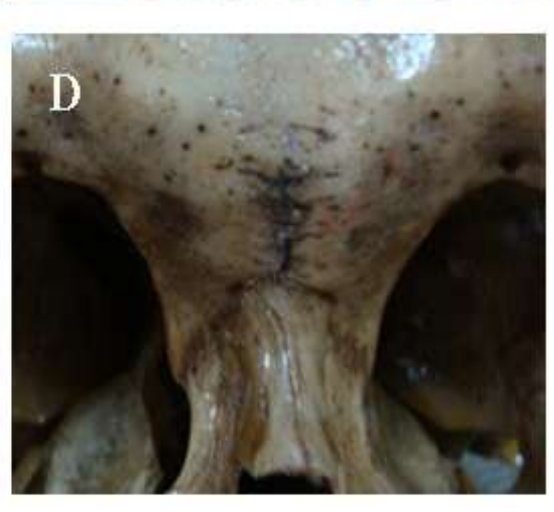
Fig. 1. A. Complete metopic suture; B. 'U' shaped metopic suture; C. 'V' shaped metopic suture; D. Incomplete metopic suture in lower part of frontal bone.