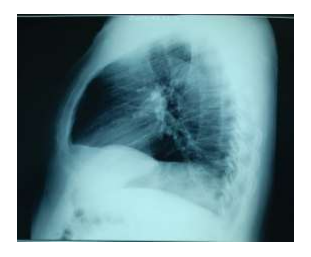
Fig. 1. Lat. c-x ray.

Local eventration may occur anywhere in the diaphragm, but it is seen most commonly in the anteromedial quadrant on the right. This finding possess no known significance (9).