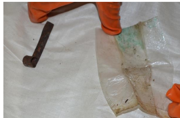
Fig. 1. Metallic plate and plastic pouch which contained some greenish material recovered from the trouser.

India is a tropical country and at our place i.e. Varanasi, Uttar Pradesh, India the temperature in the month of June varies between temperatures being 40\pm 5^{\circ}\text{C} . The body was partially skeletonised with ligaments still holding the bones together. Foul odour was coming out from it which suggested the stage of advanced decomposition. There were mature maggots;