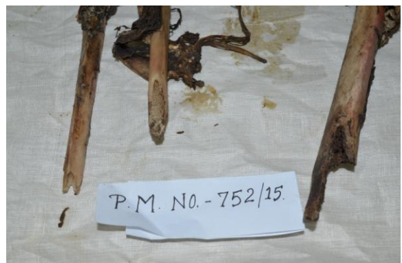
Fig. 4. Fracture of long bones (radius, ulna & humerus).