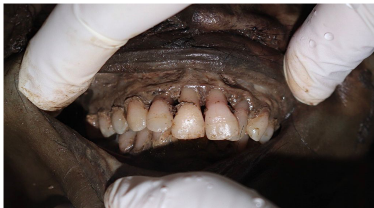
Figure 4. The PTP observed in all anterior teeth of the maxilla

The study conducted by Villalobos León et al. reported that the PTP is observed in cases where the bodies are found in water, exhibiting signs of putrefaction, with