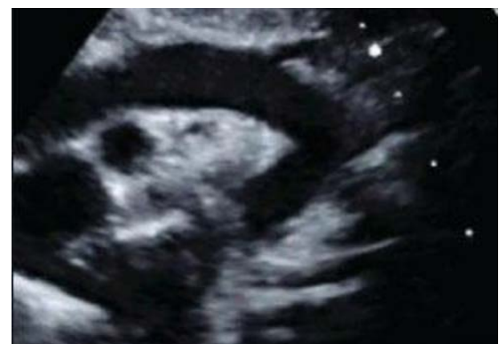
Figure 3. The post-repair echocardiography shows a normal right side aortic arch with no apparent residual lesion from resected small left side aortic arch.

The baby was born by expected delivery at 40 weeks of gestation. Her birth weight was 2750 grams. Clinical examination revealed that first and second heart sounds and lung auscultation were normal. She did not have cyanosis or wheezing. Echocardiography, after birth, confirmed the diagnosis. She also underwent CT angiography to validate the diagnosis (Fig 2). She had no signs or symptoms until the age of 3 months. At the age of three months, she presented with severe and frequent pneumonia and a surgery candidate. She had no post-surgical complications, and the procedure was successful. Post repair echocardiography showed a normal right side aortic arch with no apparent residual lesion from resected small left side aortic arch (Fig 3).