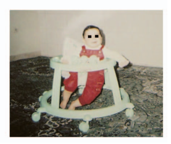
Figure 2: An apparently normal infant at the age of 7 months (right). Same child suffering from a neurodegenerative process at the age of 7.5 year (left).