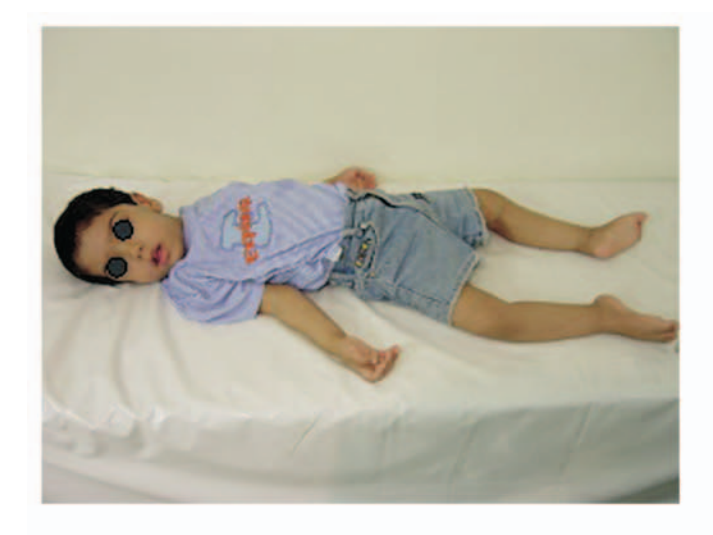
Figure 1: Family photos showing a well developed infant at the age of 10 month (right). Same patient at the age of 5 years who is bedridden due to a neurodegenerative disorder (above).

Reviewing family albums gives useful clues in the detection of neurodegenerative disorders in children. Parents of affected children who are anxious about and sensitive to their child's problem, usually bring along some earlier photos showing their kids engaged in activities which they no longer can perform, such as sitting or walking. Careful examination of these photos serves as an invaluable retrospective survey of the patient's developmental and neurological history and background (Fig 1, 2).