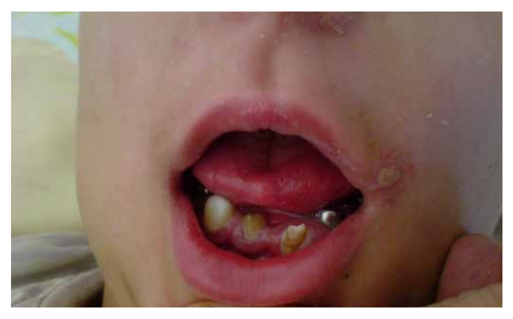
Fig 2. Oral cavity examination revealed yellowish color of the teeth with carries and smaller than normal and atypically-shaped teeth with arrested development appearance