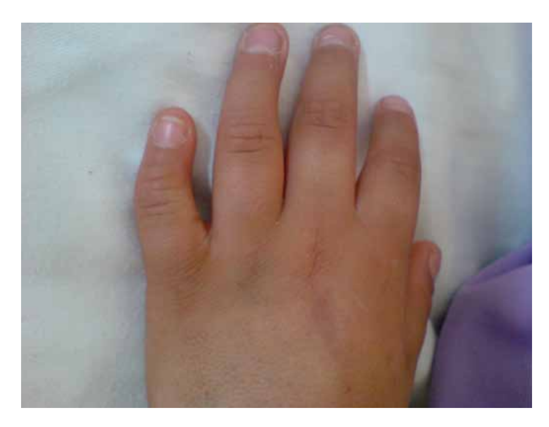
Fig3. Camptodactyly and hypoplasia of the mid phalanx of the fifth fingers