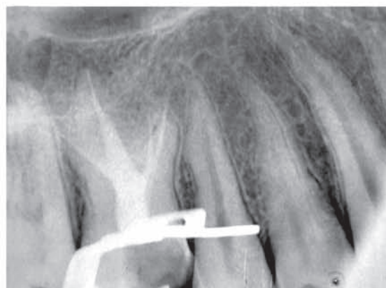
Fig 3- Periapical radiographic images immediately after root canal obturation

radiograph, both mandibular first molars had normal root configuration (Figure 1).