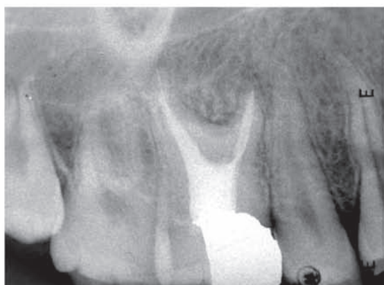
Fig 4- Radiographic image of the tooth one year after a complete root canal therapy

radiograph, both mandibular first molars had normal root configuration (Figure 1).