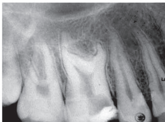
Fig 2- Periapical radiographic images of right maxillary first molar