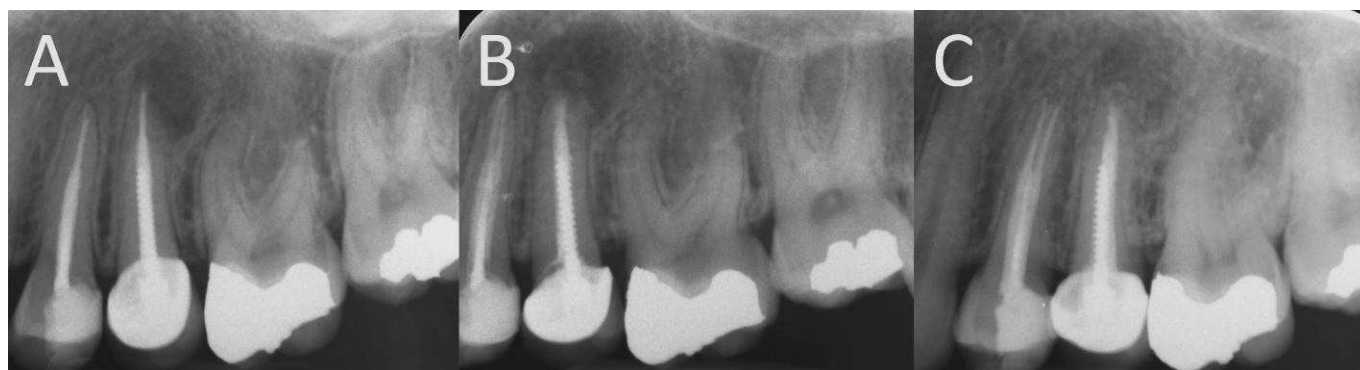
Figure 3: A) A maxillary premolar with moderate apical lesion (case No. 10); B) immediate postoperative radiograph; C) the tooth 15 months after root-end surgery shows complete periradicular healing

analysis (EDXA) demonstrated that surface topography was altered by hydroxyapatite crystal formation on CEM root-end fillings in all samples [25]. Moreover, the composition and structure of precipitated crystals were comparable with that of standard hydroxyapatite. The fact that CEM cement can make hydroxyapatite over its surface, even in normal saline solution, means that the process is independent of exogenous sources. It should be mentioned that other biomaterials do not show this phenomenon in normal saline solution.