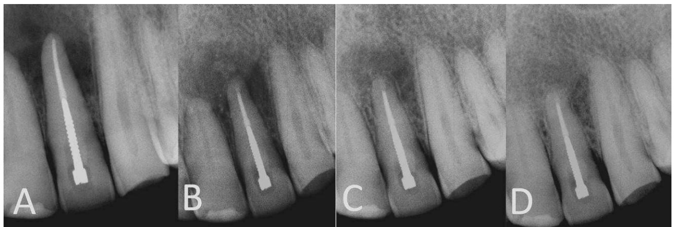
Figure 2: A) A maxillary left lateral incisor with extensive periradicular lesion (case No. 9); B) immediately after periradicular surgery; C) 4 months after surgery; D) one-year follow-up radiograph shows normal PDL

The mean time for recall was 18 months (12-26 months). There was no clinical sign of inflammation and/or infection except in one case (success equal to 93%). Cases 4 and 14 were maxillary left second and third molar, whose surgical approach was difficult; treatment outcomes were, however, satisfactory and the lesions successfully healed. The case illustrated in Figure 1 was the only re-operation case, which came to see us with a symptomatic periradicular lesion, persisting after periradicular surgery. Favorable outcomes were achieved according to the "Quality Guidelines" of ESE. Radiographic examination revealed normal periodontium in all healed teeth ( Figures 1-3 ).