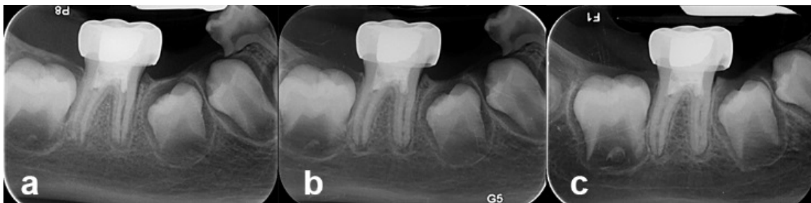
Figure 3. A) Six months follow-up; B) One year follow-up; C) Two years follow-up