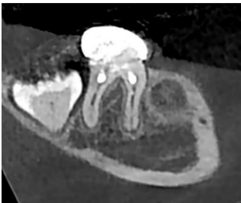
Figure 4. One year follow-up CBCT

walls & increased root length was observed in 1 year follow-up. A minor response to the cold test was observed in the one-year follow-up. The electrical test was not possible due to the presence of the stainless coating. In the one-year follow-up, the periapical radiolucency was resolved entirely (Figures 2-4).