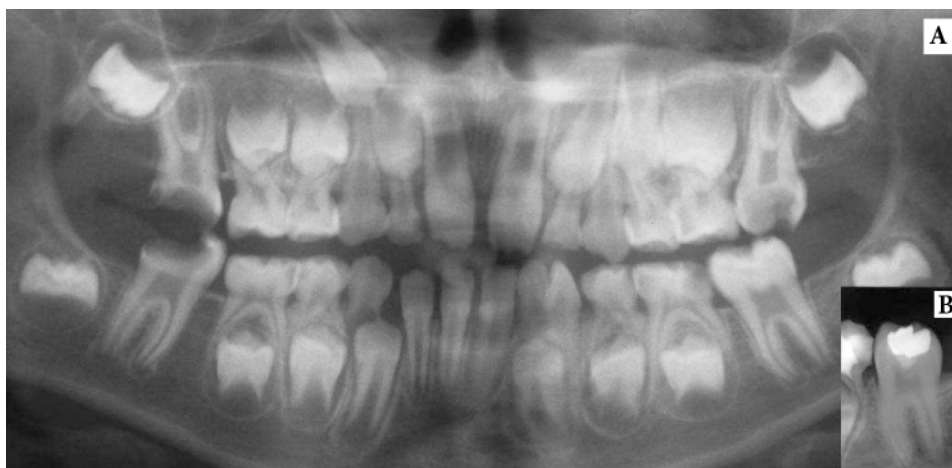
Figure 4. A) Panoramic tomography of the first left mandibular molar with no pulp exposure which has been restored; B) 18 months recall

For permanent teeth, calcium hydroxide has been the material of choice used in VPT for many years [27]. Despite its apparent success in VPT, \text{Ca}(\text{OH})_2 has been shown to be toxic to cells in tissue culture and is caustic to vital pulp tissue [28]. Therefore, an ideal VPT material should be biocompatible and stimulates dentin formation and apical development of immature teeth. MTA provides a non-resorbable seal over the vital pulp [6, 29]. Accorinte et al. reported that pulp healing with MTA is faster than with \text{Ca}(\text{OH})_2 [30]. Previous investigations showed favorable outcomes in human teeth with MTA pulpotomy treatment [31, 32].