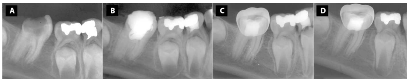
Figure 1. First right mandibular permanent molar periapical radiograph (ZOE case); A) Initial radiograph; B) Postoperative radiograph; C) Seven months recall with SS crown; D) 18 months recall