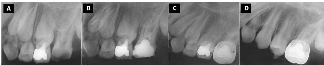
Figure 3. First left maxillary molar (CEM case); A) Initial radiograph; B) Postoperative radiograph; C) Seven months recall with SS Crown; D) 18 months recall