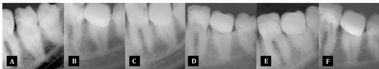
Figure 2. Periapical diagnostic and follow up radiographs of tooth 37: A) diagnostic radiograph showing a secondary caries under a composite restoration; B) 3 months after MTA pulpotomy radiograph after crowning the tooth; the periapical structure appears normal and; C-F) normal periapical structures upon radiographic follow-up visits at 12, 24, 36 and 42 months, respectively