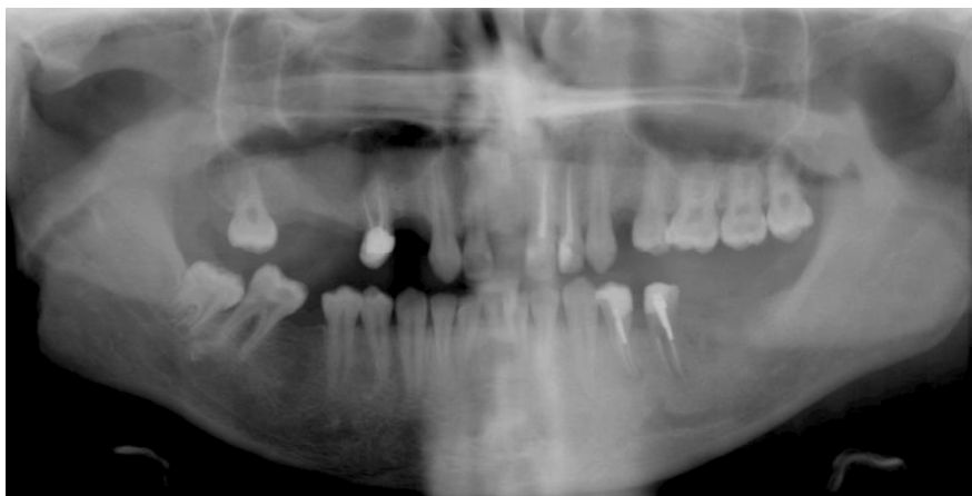
Figure 3. Dental Panoramic Tomograph of the patient after endodontic treatment

Mandibular premolars usually have one root and one canal. However, 2-4 canals have also been reported [11, 12]. Zillich and Dawson [13] showed that the incidence of three-rooted premolars was 0.04%. Rahimi et al. revealed that the incidence of three-canalled mandibular first premolars was 1.2% [14]. In a literature review, Cleghorn et al. (15) found that 0.2% of mandibular first premolars had three roots [11]. At least two radiographs, one right angle and the second at 15° to 20° angle mesial or distal from the horizontal long axis of the root, are required to reliably diagnose more than one root or root canal system [11]. Sudden narrowing of the main canal on a parallel radiograph was a good criterion to judge root canal multiplicity [15]. However, up to 40° mesial angulation from horizontal is required to reliably identifying the extra canals [16]. Deviation of the X-ray angle from the vertical axis of 15° to 30° was effective only in the mandibular first premolar in helping to visualize canal anatomy of premolar teeth. Dadresanfar et al. reported a two-rooted