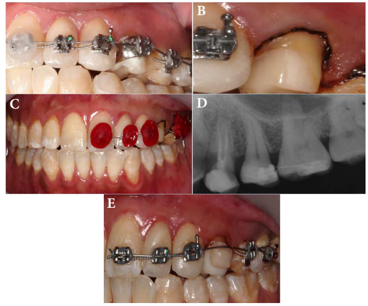
Figure 2. A ) Buccal view of orthodontic apparatus; B ) Post-retained all ceramic crown preparation; C ) Beading wax was placed on the orthodontic brackets to ease final impression for the crown; D ) Periapical radiograph eight weeks after orthodontic extrusion; E ) Composite button was placed on provisional crown