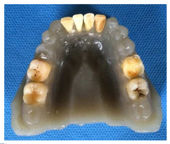
Figure 1. Agar model of mandible for CBCT evaluation

(micro-CT) [22-24] have been used. The most frequently used in vivo methods among the abovementioned techniques are periapical radiography and CBCT. Periapical radiographs can be misleading for the assessment of root anatomy due to the superimposition of the roots or their surrounding structures [1]. In contrast, numerous studies have used CBCT as an accurate method for evaluating the root canal system [25-27].