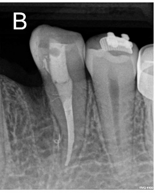
Figure 2. Hemisection and extraction of the mesial portion of the premolar; A ) Periapical radiograph before endodontic treatment; B ) Periapical radiograph after endodontic treatment

sec with LED curing light (Valo; Ultradent, South Jordan, UT, USA). After removing the rubber dam, the restoration was finished and occlusal adjustment was performed.