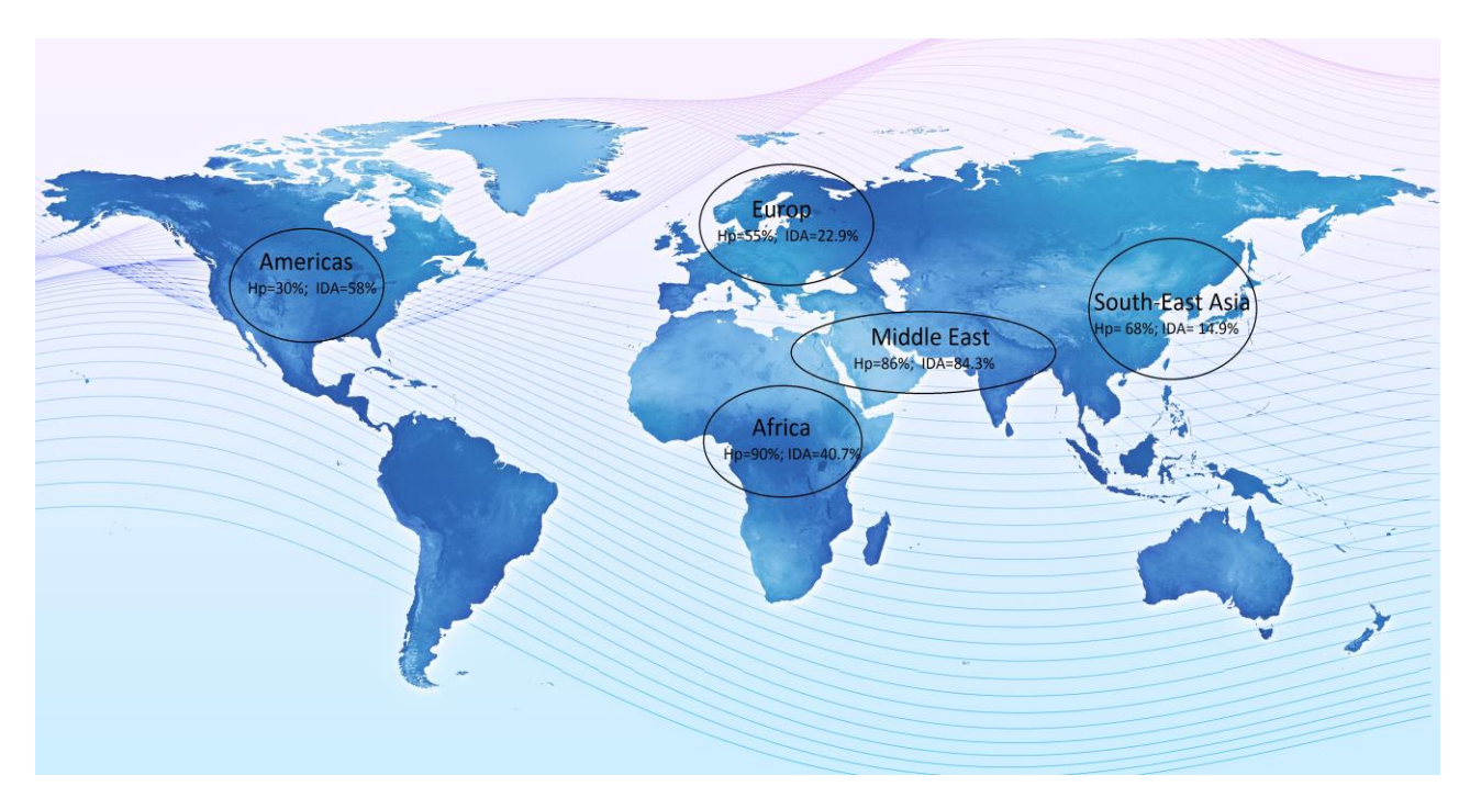
Figure 1. Global map of H. pylori (Hp) infection and Iron Deficiency Anemiea (IDA). In countries where little meat is in the diet, IDA is more prevalent than in North Americas and Europe.

testing for H. pylori infection into standard practice.