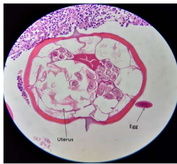
Figure 2. Cross-section of female worm with free egg in appendix lumen