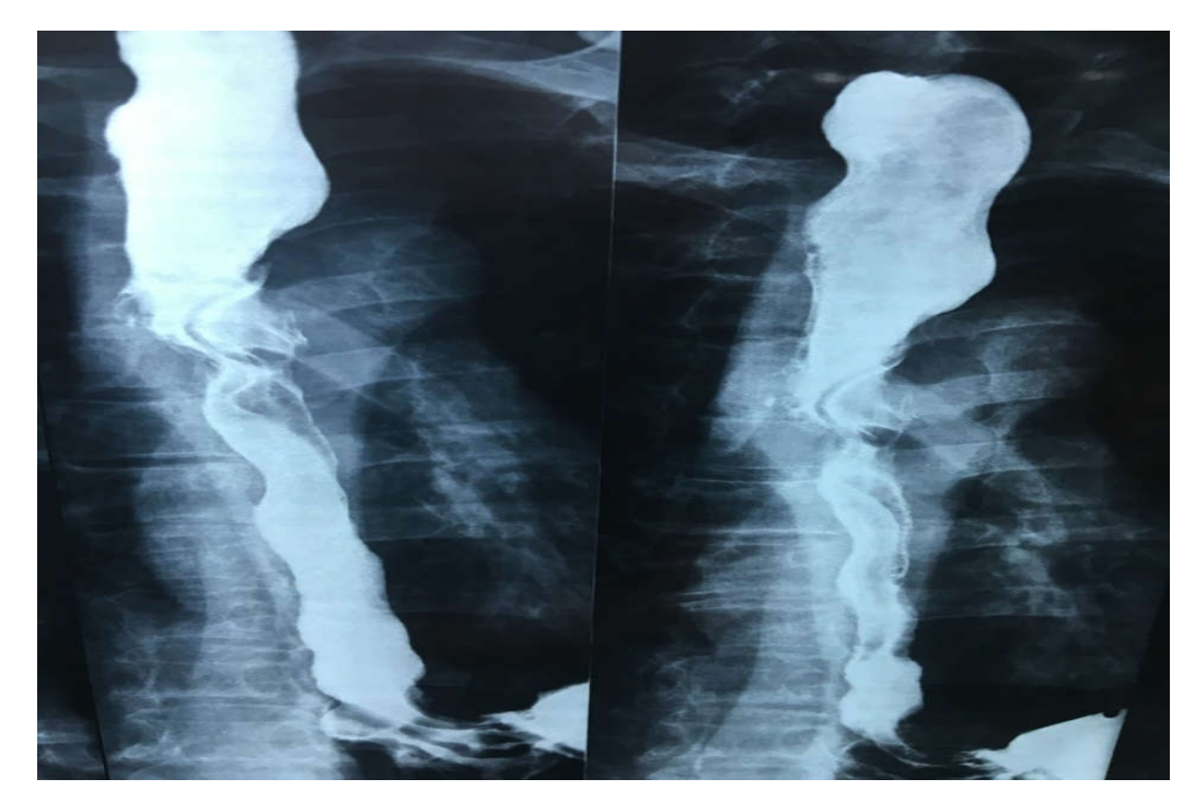
Figure 1. Barium swallow demonstrating proximal dilation of the esophagus following a disturbed region containing a foreign body.