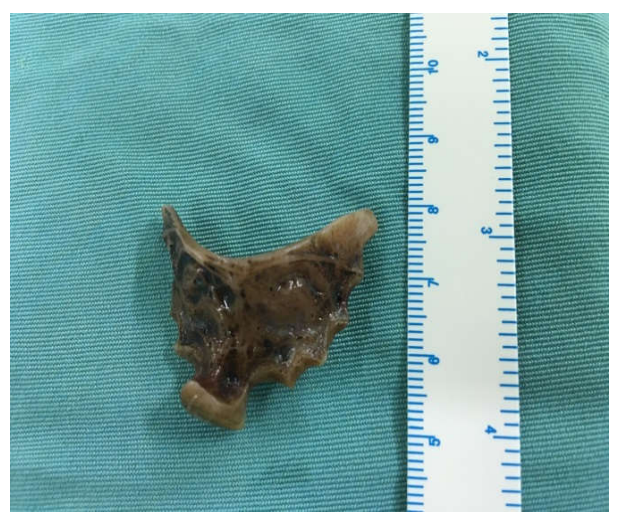
Figure 4. Foreign body after removal