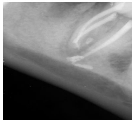
Figure 2: Immediate post-operative periapical radiograph showing sealer extrusion

Due to the presence of a periapical lesion and root resorption, Endoseal bioceramic sealer (Maruchi, South Korea) was chosen because of the higher biocompatibility of bioceramic sealers and the enhanced healing facilitated by their characteristics 2, 5, 10 . The sealer was injected into the canals using a syringe and obturation was completed using lateral condensation technique, which has been shown to yield better results than the single cone technique. 11 However, during obturation, sealer extrusion was observed, with the material overextruding into the space of the MC. Immediate bisect radiography confirmed sealer extrusion and the potential risk of its entering the IAN (Figure 2).