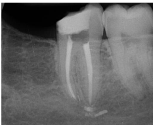
Figure 4: Thirty-six-month follow-up radiography demonstrated periapical lesion healing