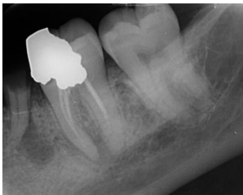
Figure 1: Initial periapical radiograph showing a radiographic lesion

A 40-year-old female with no medical illness (ASA1) presented with a complaint of crown fracture of the mandibular second molar. Coronal decay and leakage were observed clinically. Radiographically, a periapical lesion around the roots indicated inappropriate previous root treatment and underfilling of the canals. Palpation, percussion, and mobility testing yielded normal responses. However, the presence of the radiographic lesion led to the diagnosis of previously treated pulp and asymptomatic apical periodontitis (Figure 1).