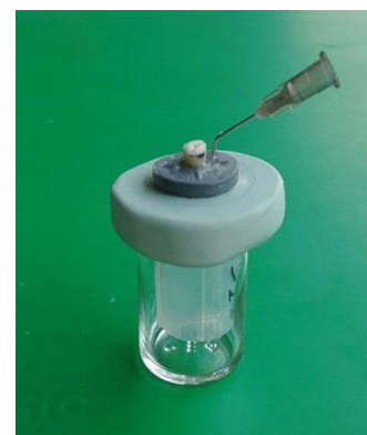
Figure 2: The vial used for collecting debris

Myers and Montgomery's experimental model was used to evaluate the amount of extruded debris in this study. 12 The weight of each tube was measured three times using a digital scale with an accuracy of 10 -4 g, and the mean weight was registered for each tube. The teeth were placed in holes created in the center of the tubes' cap and fixed using cyanoacrylate. A 25 gauge needle was inserted into the tube's plastic cap to equalize the air pressure inside and outside the tube. The whole setup was placed into a glass vial (Figure 2). The vial was covered with an aluminum leaf, so the operator was shielded from seeing the roots during preparation.