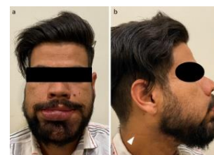
Figure 1: Extraoral photographs: (a) Frontal view and (b) profile view indicating the enlargement of the lower face and lip, obliteration of the nasolabial fold, and elevation of the nasal alae. The lower lip had a slightly bluish-red color. A surgical

A 28-year-old male patient was referred to the oral and maxillofacial radiology department for pre-implantation radiographic evaluations. He had a history of recurrent lesions in the left submandibular and right cervical regions, underwent biopsy, and was diagnosed with HLA histopathologically. He reported no related symptoms. His medical history was not significant, and no history of trauma was reported. His family history was also unremarkable. An extraoral examination demonstrated the enlargement of facial soft tissues, especially in the lower third of the face. The nasolabial fold was obliterated on the right side, with elevation of the nasal alae (Figures 1a-1b). Additionally, an intraoral examination revealed the patient's poor oral hygiene and the presence of multiple exophytic sessile masses in the buccal and labial mucosa, with pink to bluish color (Figures 2a-2b).