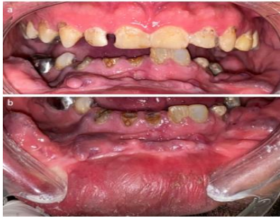
Figure 2: Intraoral photographs indicating exophytic masses with a pink to bluish color: (a) Centric occlusion view and (b) cropped mandibular occlusal view. Severe carious lesions could be observed due to poor oral hygiene.

scar on the right side of the neck (white arrowhead) related to a previous surgery could be observed.