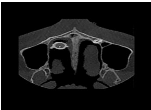
Figure 2. On this axial CBCT view, mucosal thickening of the anterior, lateral, and medial walls of the nasal fossa with central calcification of nidus and atrophic right inferior turbinate can be seen.

The mass measured approximately 12 mm (width) × 8 mm (height) on the coronal view and 15 mm (width) × 8 mm (height) on the axial view in its greatest dimensions. On the coronal view, the mass was located on the floor of the nasal cavity right below the inferior turbinate and caused a thickening of the nasal mucous membrane in this region. The calcification extended to the middle of the nasal septum with no bone erosion. Obvious atrophy of the osseous and mucosal tissue of the inferior turbinate was visible. The level of the inferior turbinate from the lateral nasal wall and the height and width of the infundibulum had not been affected. The sinuses were free from any pathology (Figure 1). On the axial view, mucosal thickening of the anterior, lateral, and medial walls of the nasal fossa was seen (Figure 2).