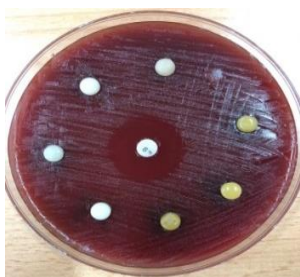
Figure 1: The disk diffusion control

The discs were placed in tubes containing BHI broth and S. mutans , equivalent to 0.5 McFarland, and incubated under CO 2 at 37°C. The glass ionomer discs were retrieved from tubes containing the culture medium in one-hour, 24-hour, and 15-day intervals (Figures 2-4) and rinsed with 1 mL of physiological serum for five minutes in a vortex® mixer at 1000 rpm to detach bacteria from the glass ionomer discs. At this stage, the discs were excluded from the study. To determine the bacterial count, the resulting irrigation solution was cultured on blood agar medium, containing sheep blood at 37°C for 24 hours, and the bacterial colony count was determined for each disc. 12