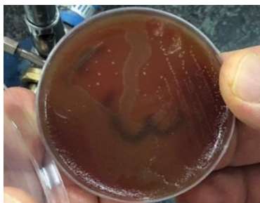
Figure 4: Bacterial colony count after 15 days