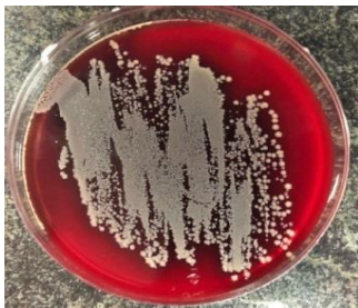
Figure 2: Bacterial colony count after one hour