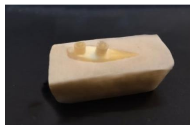
Figure 5: Samples prepared for the shear bond strength test

To carry out this test, 96 sound human premolars without caries, cracks, abrasions, or developmental anomalies were collected. The tooth samples were extracted in less than three months ago. The teeth were mounted in cold-cured acrylic resin with the tooth's buccal surface half out of the acrylic resin. Next, they were cut in the mesiodistal direction on the buccal aspect, using a high-speed handpiece (High-Speed Air Turbine Handpiece, CH-Σ®, Tokyo, Japan) and a medium-grit diamond bur (837XLG.FG.014, Jota®, Switzerland) under air-water spray to achieve a dentin surface on the root and crown for bonding with RMGI. From each tooth, one crown sample and one root sample were prepared (Figure 5).