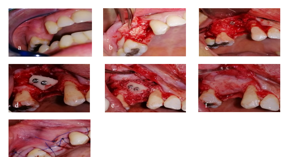
Figure 2- Clinical views of re-treatment procedure in the second surgery