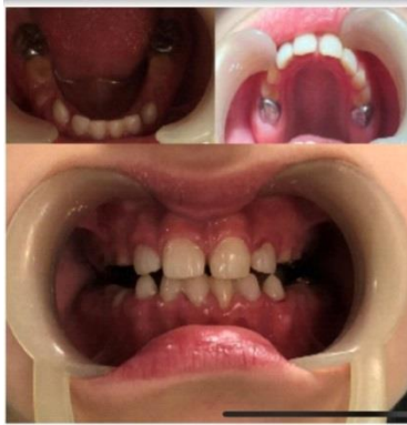
Figure 3- Post-treatment intraoral view

molars as they were extensively worn and had hypersensitivity. Six- and twelve-month recall sessions were scheduled to monitor the retention and stability of the treatments performed. Additionally, in the first follow-up session after six months, both mandibular permanent canines were restored with composite resin (Figure 3). The patient was motivated to improve her oral hygiene.