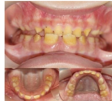
Figure 2- Pre-treatment intraoral view

Biochemical and endocrinological laboratory tests revealed no hormonal or calcium metabolism related deficiencies.