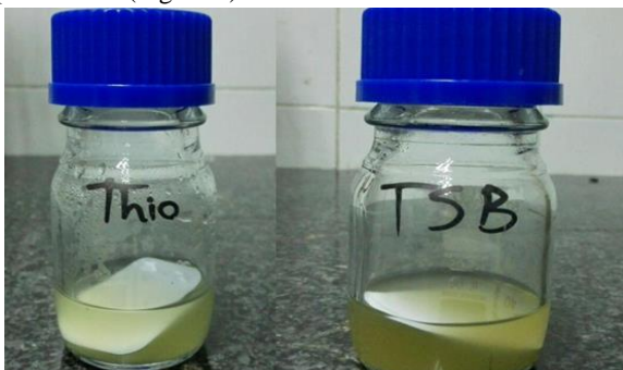
Figure 1- TSB and Thio containing bottles showing turbidity after incubation

Isolation of Staphylococcus aureus (S. aureus): The samples that showed presence of Gram-positive cocci in microscopic observation underwent catalase testing to differentiate Staphylococcus from Streptococcus. Mannitol salt agar (Chapman) medium was used to differentiate S. aureus from Staphylococcus epidermidis (S. epidermidis) and Staphylococcus saprophyticus (S. saprophyticus). Then, coagulase testing was performed by the tubular method. This test is positive for S. aureus, and negative for S. epidermidis. (Figure 1)