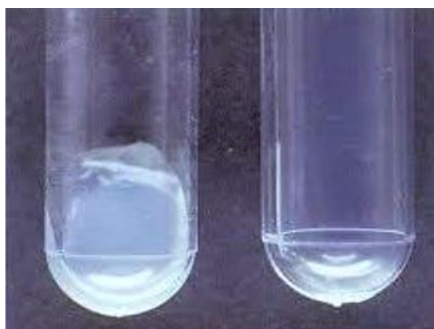
Figure 2- Coagulase testing. The presence of S. aureus was revealed by coagulation found in the left test tube.