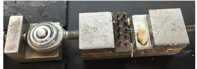
Fig. 2- Shear bond test by universal testing machine

evaluated under a stereomicroscope (SZX 16; Olympus, Japan) at x10 magnification in order to determine the mode of failure.