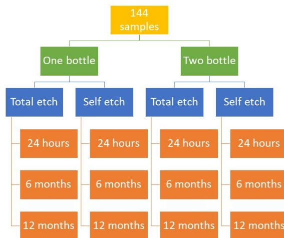
Figure 1- Distribution of samples in the experimental groups

specimens were randomly allocated to 12 groups (12 samples per each). Figure 1 shows sample allocation to the groups. For the first group, a single-bottle bond and for the second group, a two-bottle bond was used in both SE and TE modes. Table 1 describes the manufacturer's instructions for each type of adhesive. Table 2 shows one and two-bottle All-Bond Universal ingredients.