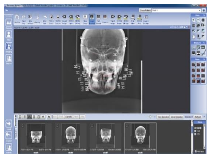
Figure 2- Distance measurement on conventional 2D posteroanterior image by Romexis software for two-dimensional images