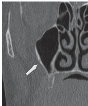
Figure 1- Posterior superior alveolar canal

CBCT scans were evaluated for the below-mentioned parameters (Figures 1-3):