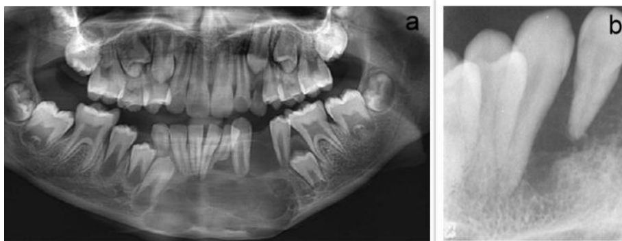
Figure 3- (a) Central giant cell granuloma in the anterior mandible (b) osteolytic osteosarcoma in the anterior maxilla