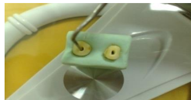
Figure 1- Teeth mounted in putty on digital balance

(Germany) with an accuracy of 0.01g to calibrate the scale for each root piece (Figure 1).