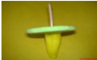
Figure 2- Tooth fixed to an acrylic plate

The plate had a 28-gauge needle to connect to fluid filtration system with pressure set at 30 Psi. A period of 15 minutes was allowed for widening of the pipe and stabilization of conditions. The rate of bubble flow was recorded for 10 minutes. To make the results comparable with those of other studies, the values were divided by 21020 to obtain the microleakage value in micro-liter per minute in pressure of one centimeter of water. The average rate of readings of liquid microleakage was compared among the groups after one minute (9,15). The fluid filtration system was built based on a study by Derekson et al, in 1986 (16).