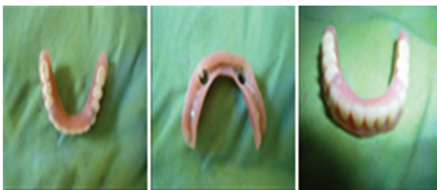
Fig 3. Lower denture.

It is mandatory to avoid sophisticated permanent treatment modalities at this age since such children are still in the process of growth and development. Such treatment plans are usually postponed until growth is completed and the maxillofacial components reach a more stable stage.